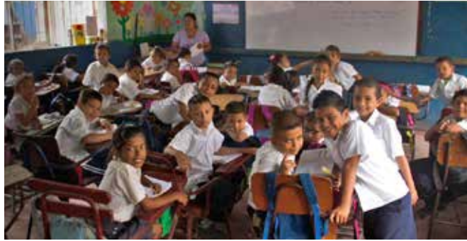
Nicaraguan school children in class.

ACECEN provides training and mentoring to a network of 95 schools from a variety of socio-economic backgrounds, encouraging them to support one another by sharing resources and expertise. At the same time, essential relationships are built and school leaders are able to uphold each