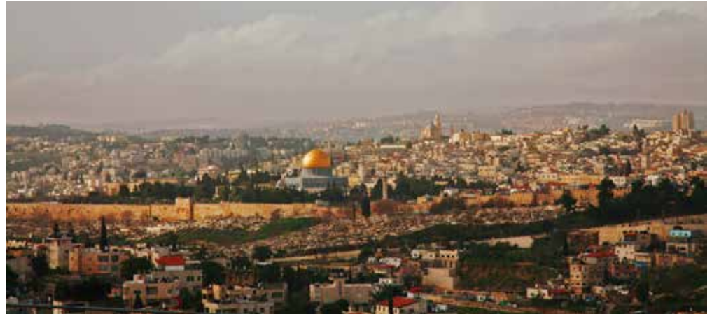
Back to the Bible Canada is inviting interested people to experience Israel this fall during a unique travel opportunity.

Taking place October 30-November 9, The Israel Experience will be an unforgettable 11-day journey featuring four-star accommodation, as well as daily breakfast and dinner buffets. Participants will be able